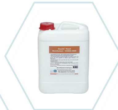
Product code: OODH-5000 Oosafe® Hand Disinfectant, 5 Liters refill container