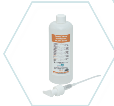
Product code: OODH-0500 Oosafe® Hand Disinfectant, 500 ml with pump