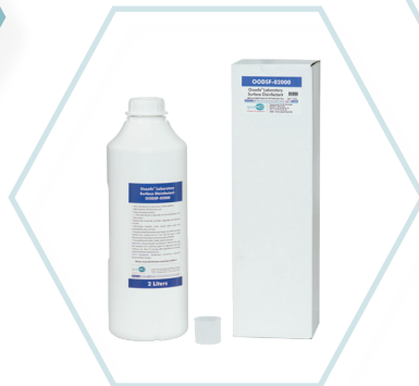
Product code: OODSF-02000 Oosafe® Laboratory Surface Disinfectant, 2 Liters with dose cup