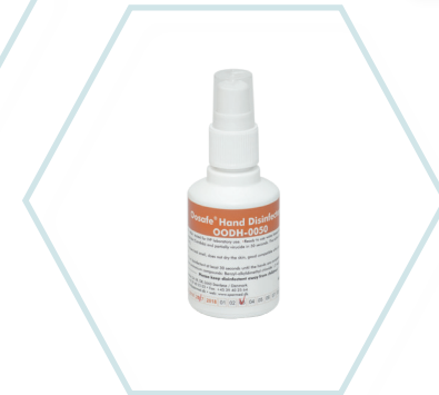
Product code: OODH-0050 Oosafe® Hand Disinfectant, 50 ml in spray bottle