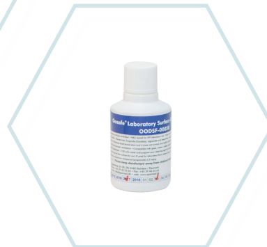
Product code: OODSF-00050 Oosafe® Laboratory Surface Disinfectant, 50 ml in bottle