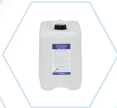
Product code: OODSF-10000 Oosafe® Laboratory Surface Disinfectant, 10 Liters refill container