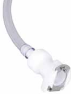
Line Connector : AS-852085

The best way to reduce the VOCs level with ASTEC Filter 6 (six months longevity).