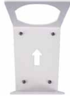
Holder : AS-852585