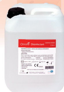
Product code: OOMD-05000 Oosafe® Disinfectant, 5 Liters refill container