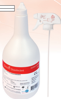
Product code: OOMD-01000 Oosafe® Disinfectant, 1 Liter bottle with spray