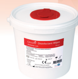
Product code: OOMDW-120 Oosafe® Disinfectant Wipes, 70 wipes per bucket