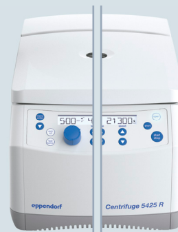
rotary knob version